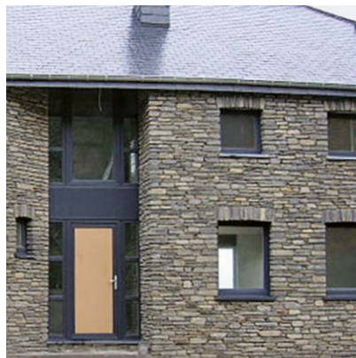
Private house, Lambert