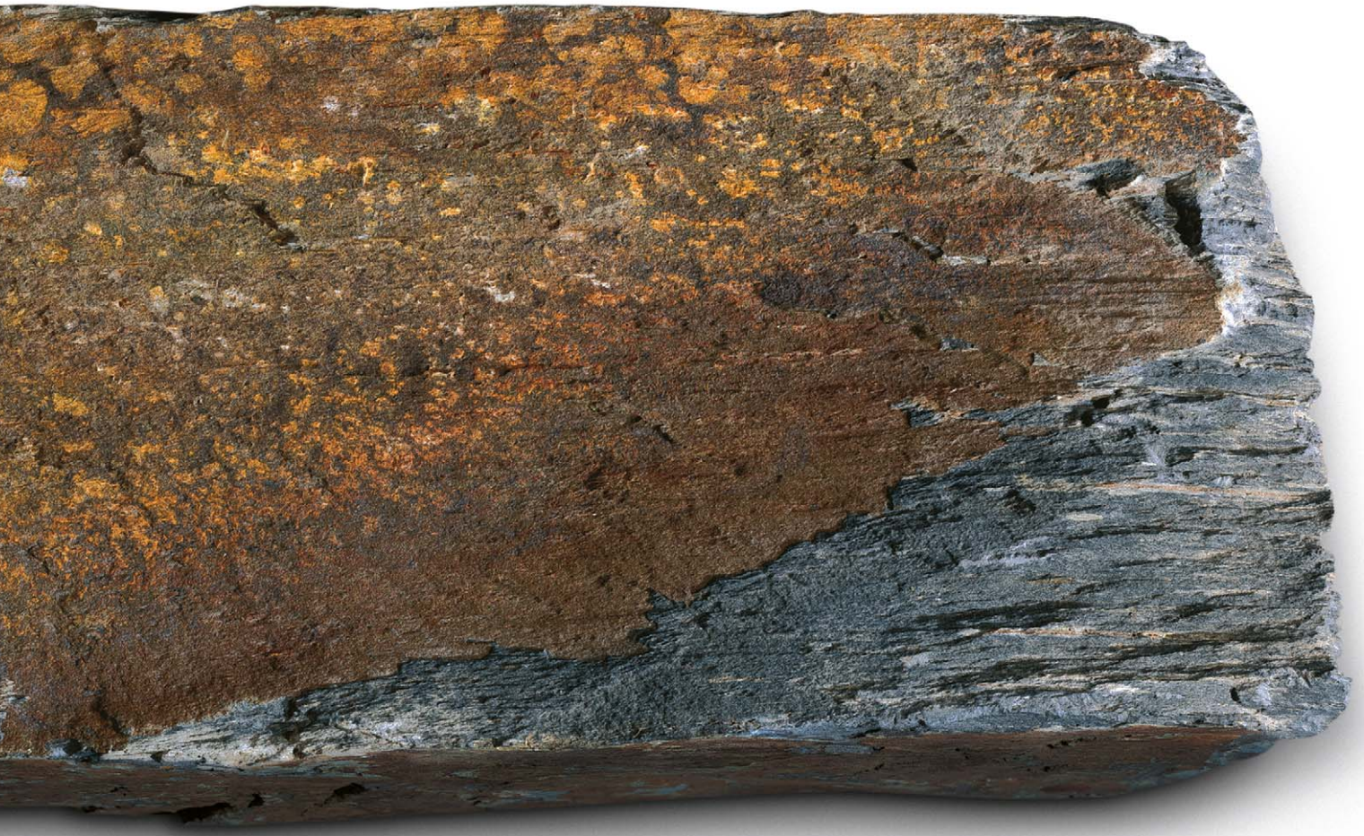
Rubble stone (scale 1:1)