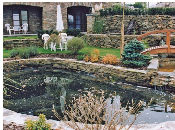
Rochehaut, hotel "Auberge de la ferme"

Non-standard dimensions, in addition to advice on application and maintenance, can be obtained directly from the producer.