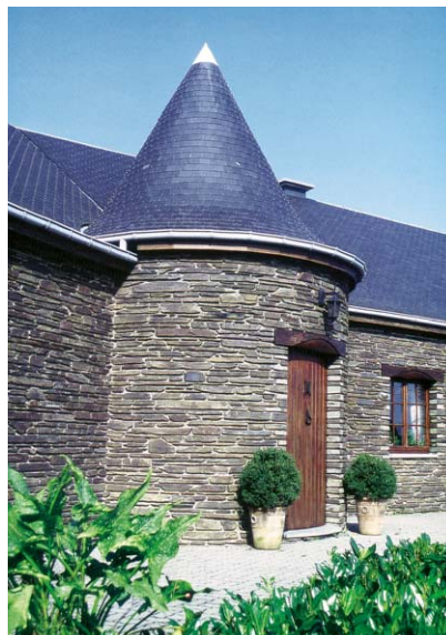
Six-Planes, private house