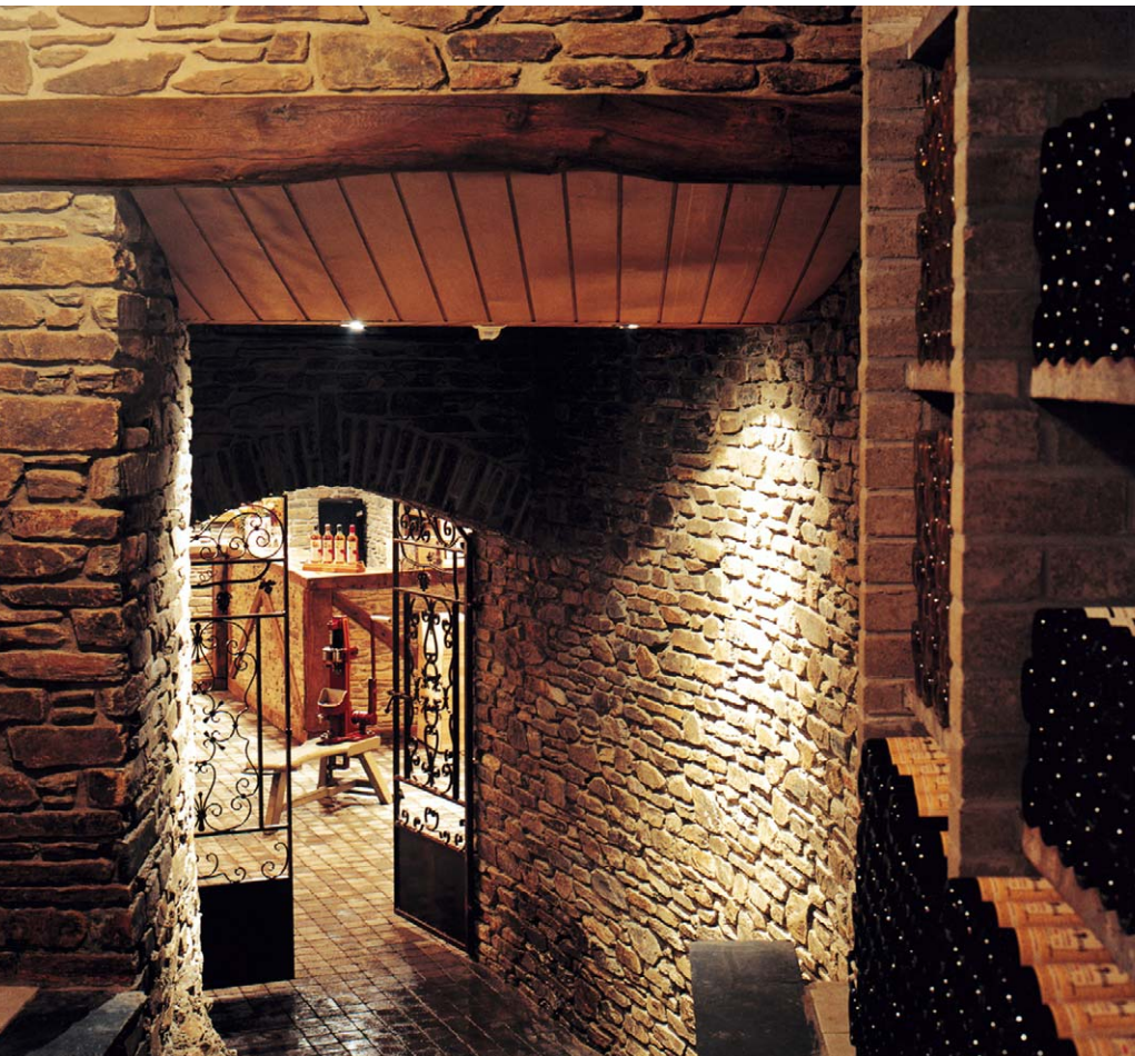
Rochehaut, wine cellar