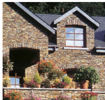
Bohan, private house