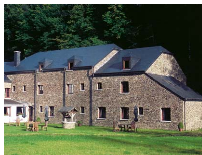
Laforet, hotel "Le moulin Simons"