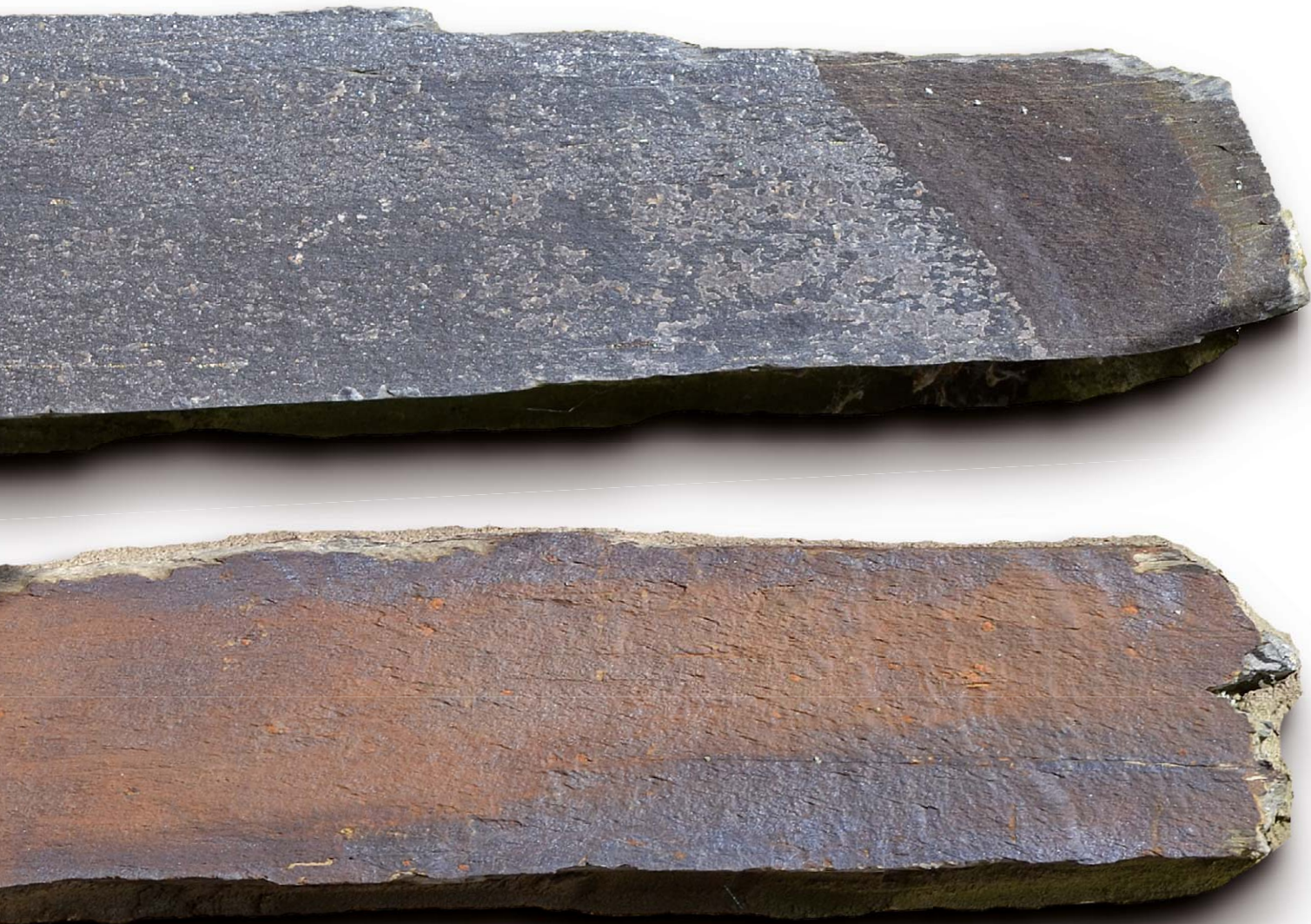
Blue and brown rubble stone