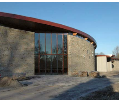
Semi-dressed rubble stone