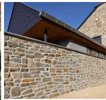
Roughly dressed rubble stone masonry