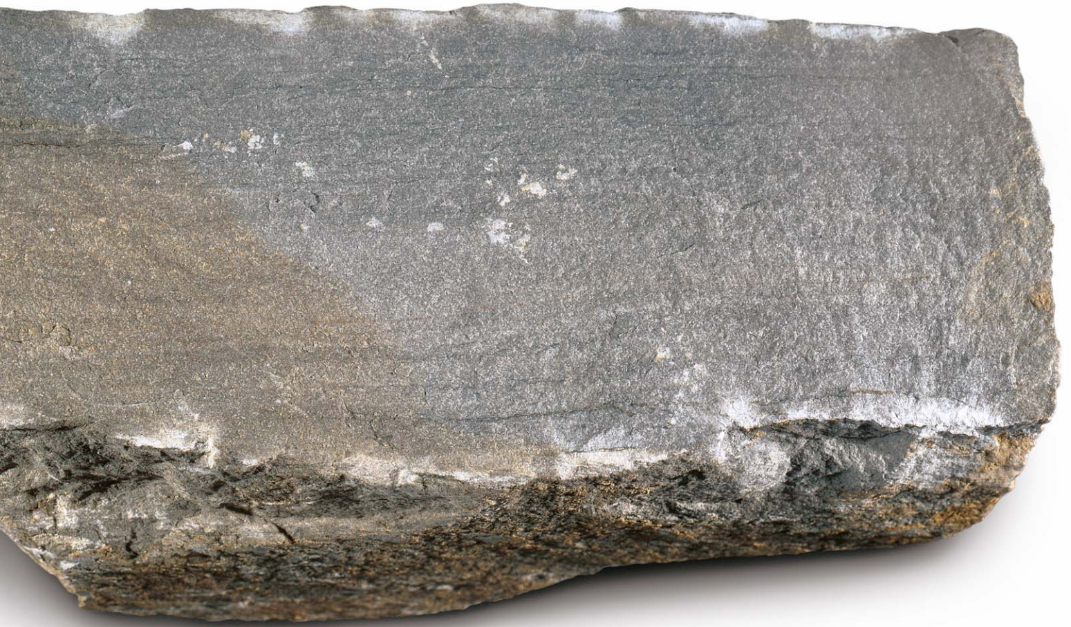
Rubble stone (scale 1:1)