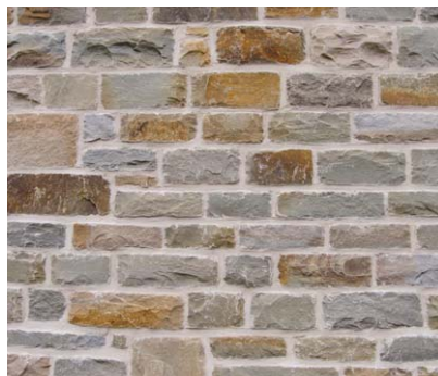
Squared rubble stone