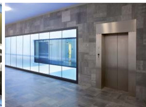
© Osar Architecten · Sawn finish