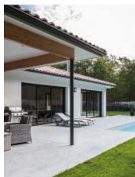
Blue flamed finish