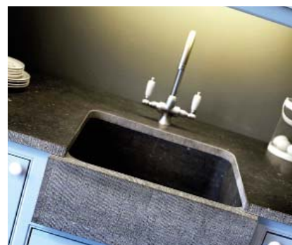
© Abbin · Dark blue combed honed finish