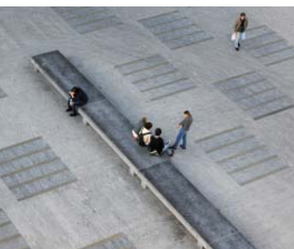
© MS-A · Products: EnoPure® Cobbles · Sawn bench