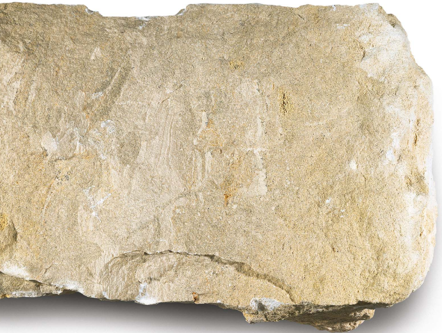
Rubble stone (scale 1:1)