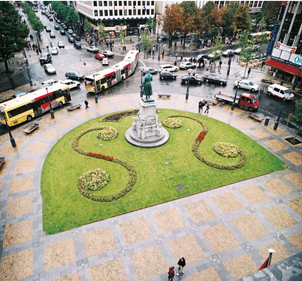
Liège, place de l'Opéra, arch. Claude Strebelle, 2000