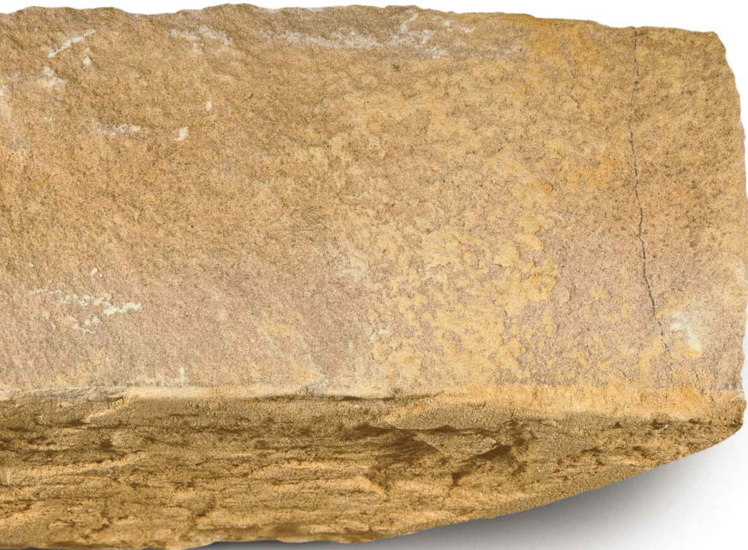
Rubble stone (scale 1:1)