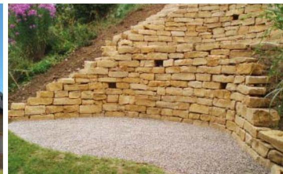
Dry stone masonry