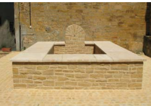
Fountain, Marville (F)