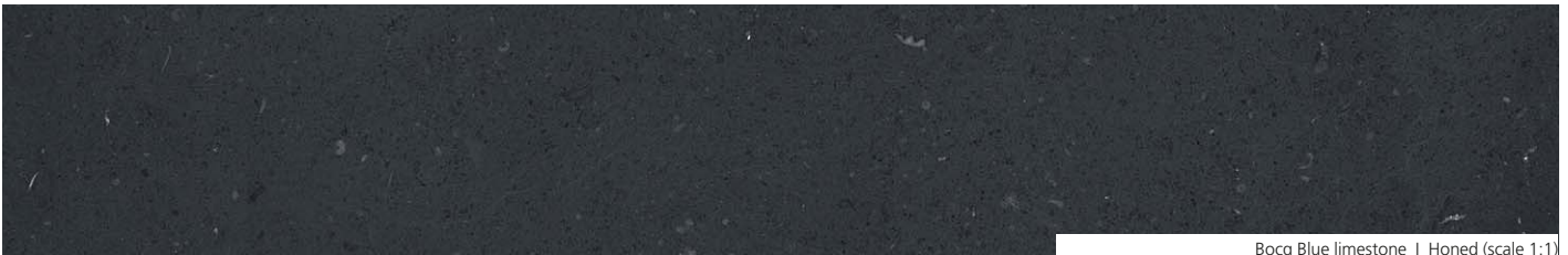
Bocq Blue limestone | Honed (scale 1:1)