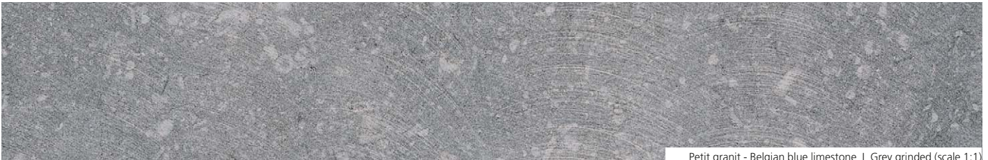
Petit granit - Belgian blue limestone | Grey grinded (scale 1:1)

The CHANSIN QUARRY is situated in the Bocq valley, near the hamlet of Chansin. Blue limestone is quarried there and has taken the name of “Petit Granit du Bocq” because of its location. It is characterised by its concentrations of crinoids and fossils, its bluish appearance and the deep black colour that it acquires when polished. These features mean that it is unique in Belgium and stands out from other varieties of blue limestone.