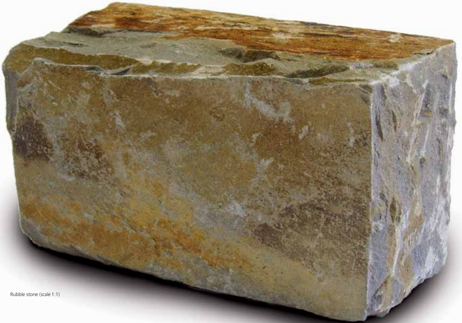
Rubble stone (scale 1:1)