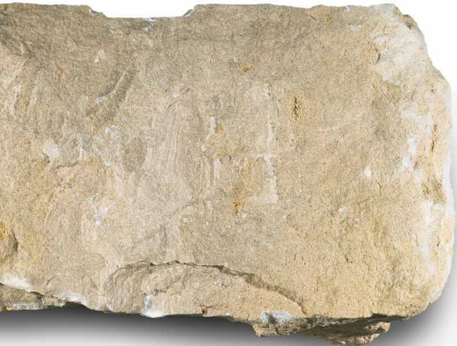
Rubble stone (scale 1:1)